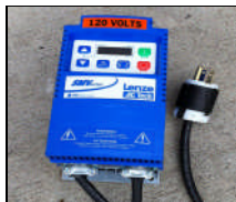
VARIABLE SPEED DRIVE