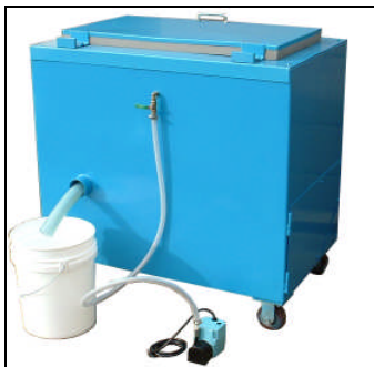
OPTIONAL RC500 PUMP & BUCKET